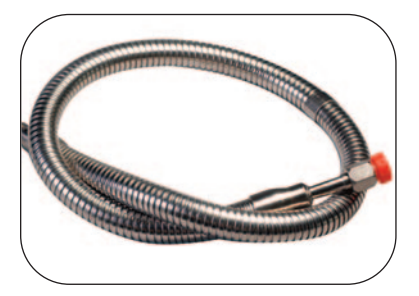
Flexible Fill Hose with 1.27 cm I.D. includes dual swivel connectors and a 3/8" male NPT adaptor included with purchase.