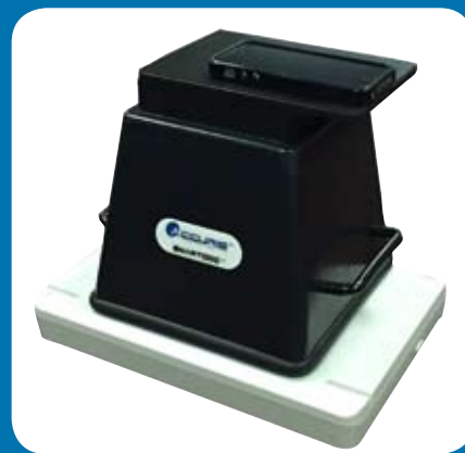
Use with SmartDoc™ for gel imaging with a smart phone