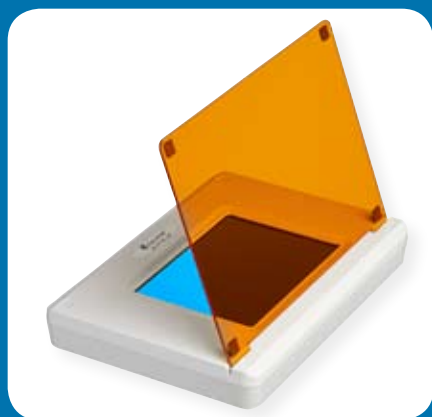
Amber cover raised for easy gel access

An array of super bright LEDs with a long, 30,000 hour service life provide the light source for the SmartBlue Transilluminator. Unlike those in a UV transilluminator, the filters in the SmartBlue will not solarize and degrade in performance over time. Gel bands can be excised directly on the scratch resistant, glass viewing surface. To save energy, the power switch includes an automatic 5 minute shutoff. The SmartBlue Transilluminator is covered by a 2 year warranty.