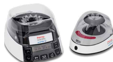
Thermo Scientific™ mySPIN™ 12 and 6 mini centrifuges

*Rotor sold separately. Check on rotor and accessory compatibility with selected centrifuge.