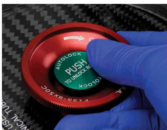
Auto-Lock Rotor Exchange