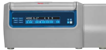
Megafuge ST4R Plus Centrifuge

Our TX-1000 microplate and TX-750 blood tube and cell culture packages are available, but the centrifuge must be purchased separately.