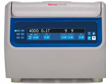
Megafuge ST1 Plus Centrifuge