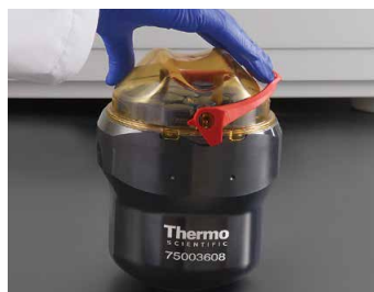
ClickSeal Biocontainment Lids