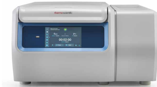
Multifuge X1R Pro Centrifuge