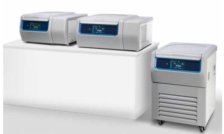
The family of Multifuge Pro and Megafuge Plus General Purpose Centrifuges includes the 1.6 L & 4 L benchtop centrifuges and floor standing options.