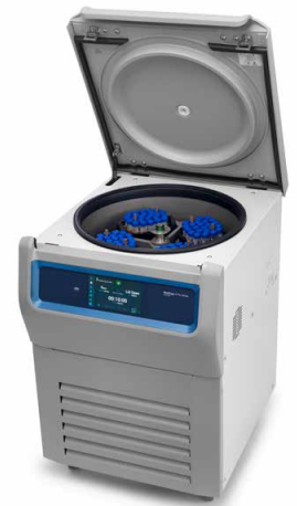
Multifuge X4R Pro Centrifuge