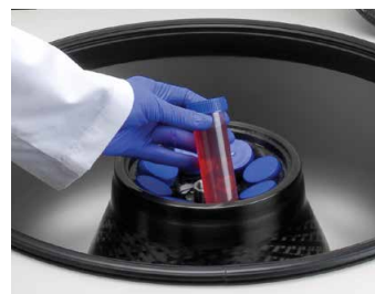
Fiberlite Carbon Fiber Rotors