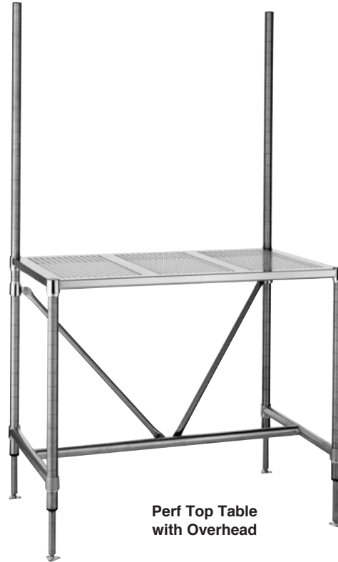
Perf Top Table with Overhead