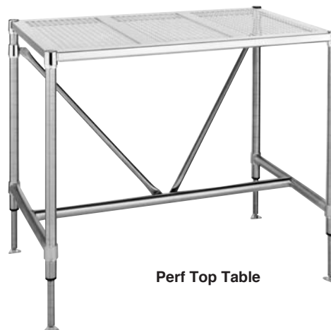
Perf Top Table