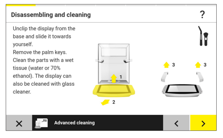
Figure 3 and 4: Example Screenshots Representing the Advanced Cleaning Process for Deep Cleaning.

The interval of the respective cleaning procedure as well as the contamination criterion can be adapted to the user's needs. The balance can be configured to actively trigger the respective cleaning workflow by displaying the contamination status prominently in the status center or recommending for a cleanup before logout. At the same time function tests assure the weighing performance after the cleaning process is completed which further ensures a proper cleaning process.