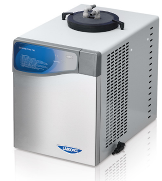
CentriVap -84° C Cold Trap