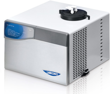
CentriVap -105° C Cold Trap