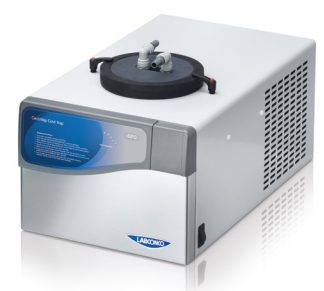
CentriVap -50° C Cold Trap