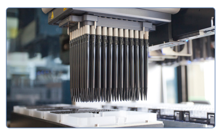
Figure 1: CO-RE 96 Probe Head.